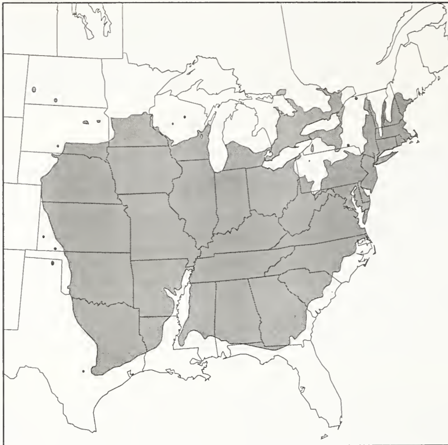
Figure 1.—Range of eastern redcedar, Juniperus virginiana L. (Little 1971).

Eastern redcedar is commonly used for posts, novelty items, chests, and as shelterbelts/windbreaks. It is an important species for wildlife food and cover. Considerable variation in color and compactness makes eastern redcedar and its cultivars among the best of native ornamental evergreens.